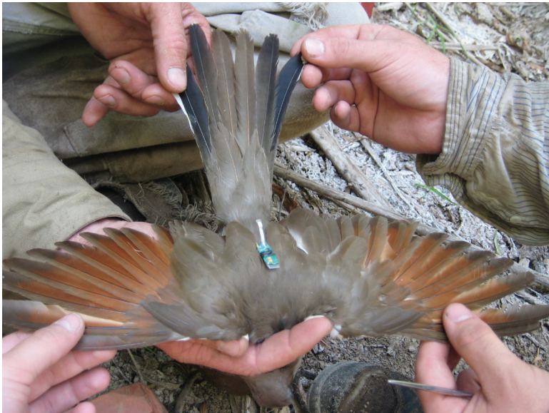
Figure 1. Yellow-billed Cuckoo with geolocator attached.

We used the BASTrak (BAS) suite of software and a standard method (e.g., Heckscher et al. 2011) of analysis of the geolocator data, a single-threshold technique, which equates a certain sun elevation with a certain light level). We calibrated the retrieved geolocator under an open sky, and the comparison of the open calibration data with the known site of deployment indicated the data points were shifted south by approximately 3° (J. Fox pers. comm.); this shift is likely due to heavy shading consistent with the riparian overstory along the middle Rio Grande and, presumably, the