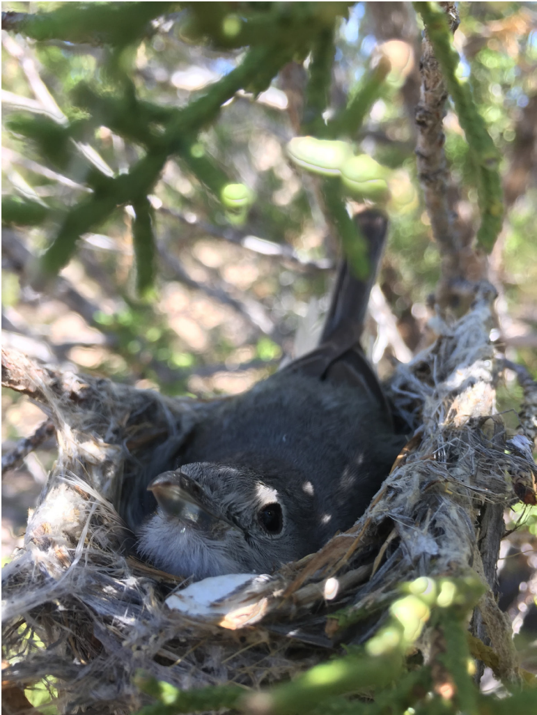
Gray Vireo ( Vireo vicinior ) on nest, Sevilleta National Wildlife Refuge, New Mexico, 9 June 2020.